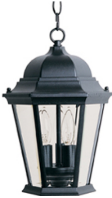
1009BK Westlake Cast 3-Light Outdoor Hanging Lantern