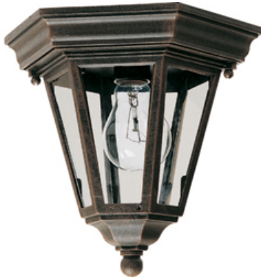
1027RP Westlake Cast 1-Light Outdoor Ceiling Mount