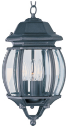
1036BK Crown Hill 3-Light Outdoor Hanging Lantern