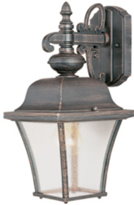
1066RP Senator 1-Light Outdoor Wall Lantern