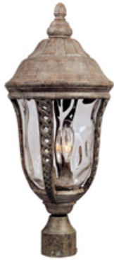
3101WGET Whittier Cast 3-Light Outdoor Pole/Post Lantern