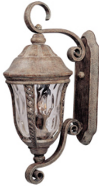
3108WGET Whittier Cast 3-Light Outdoor Wall Lantern