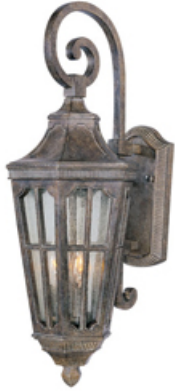
40153CDSE Beacon Hill VX 2-Light Outdoor Wall Lantern