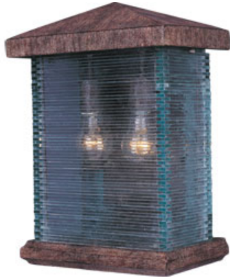
48734CLET Triumph VX 2-Light Outdoor Wall Lantern