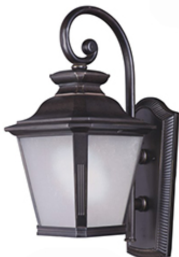
51127FSBZ Knoxville LED Outdoor Wall Lantern