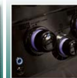
Built In Control Panel Lights