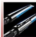
Stainless Steel Dual-Tube™ Burner System