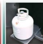
Pull Out Tank Drawer