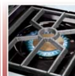
Commercial Grade Side Burner