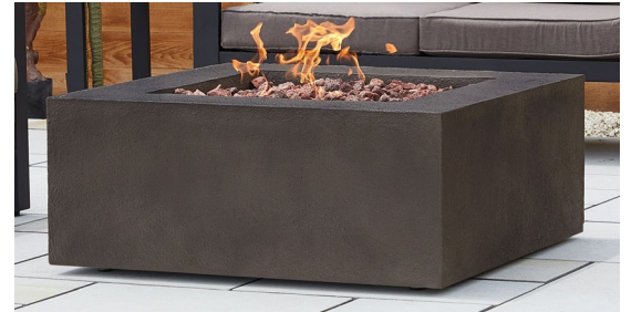
Available in kodiak brown (9720NG-KG)