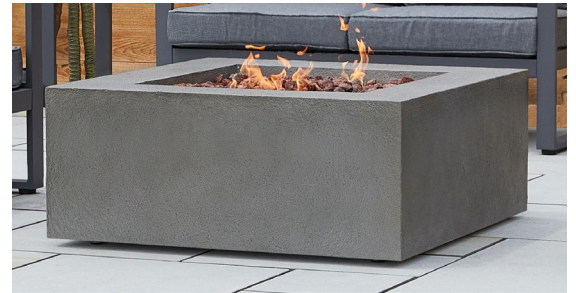
Available in glacier gray (9720NG-GLG)