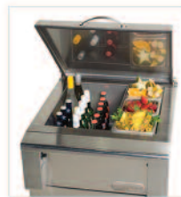
Libation, smoothie juice bar

Incredibly Versatile! Great for use as a bottle cooler, mug froster, martini freezer, fresh fruit smoothie and juice center, deli-prep center, burger topping/condiment bar, salsa bar, bottle/ice bath, wine cooler, Keggerator, and dessert bar!