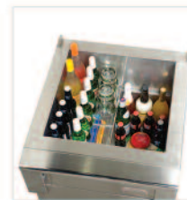
All provision and glass chiller