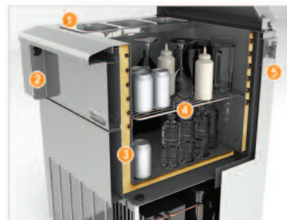
Cutaway view showing frost wall design