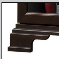
Raised base and leg detail