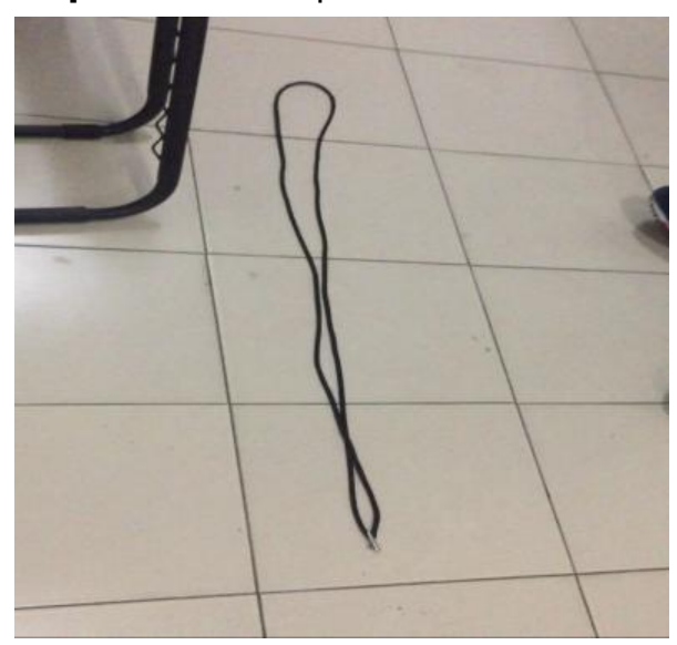
Step 2 : Put through the folded rope into the first hole of the steel frame, tie a knot to ensure a secure end.