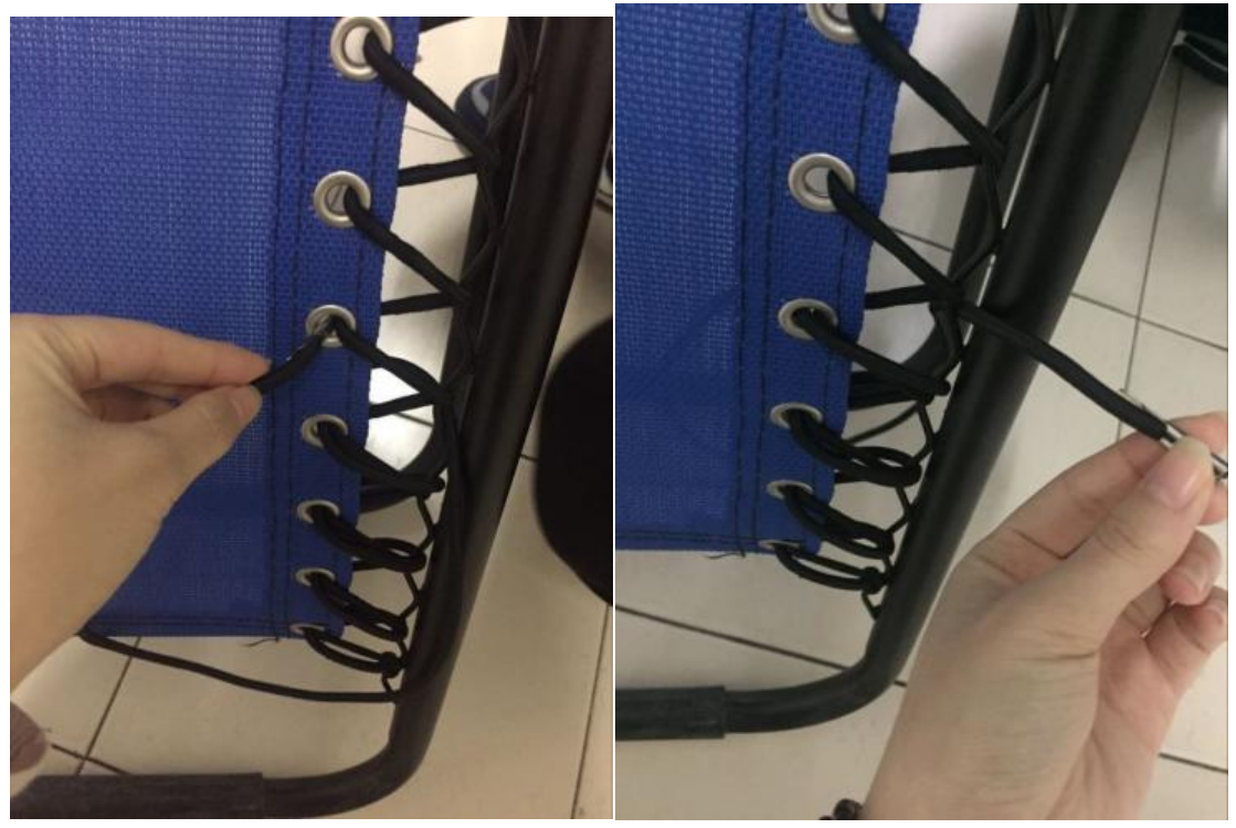
Step 8 : Finally put the lace into the last hole on the back of the fabric. The metal ending on the lace will help ensure the laces won't unravel.