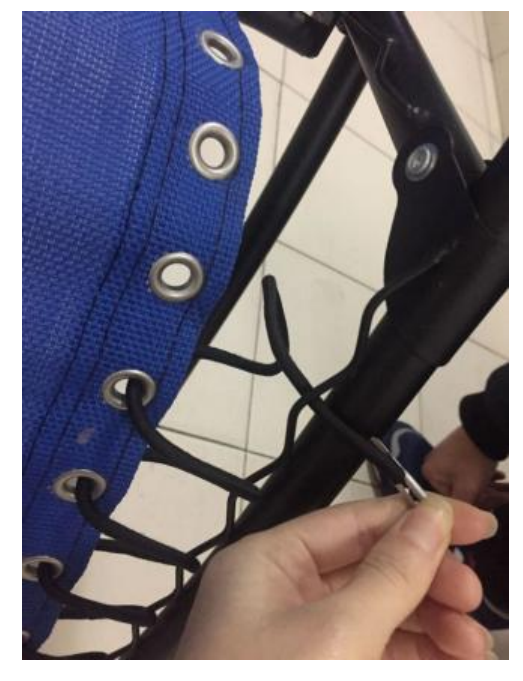
Step 6 : When running lower on the bungee lace, place the lace through the gravity chair eyelet and turn the black metal ending of the lace. For better appearance make sure to have the metal ending on the bungee lace on the backside of the chair. The metal ending will ensure the lacing won't unravel.