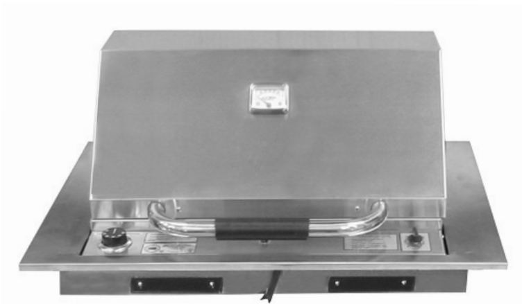
24" MODEL IS 4400-EC-336-JACT-24