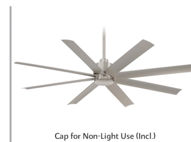
Cap for Non-Light Use (Incl.)