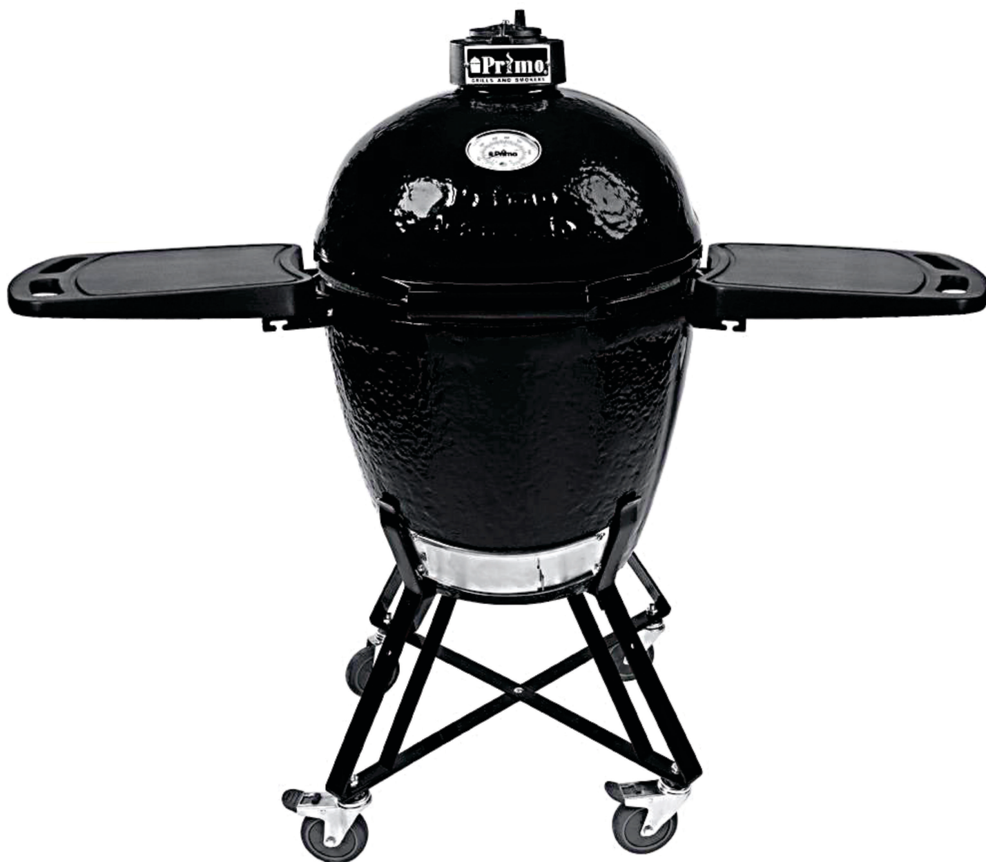
Primo - Completed Round Grill Assembly