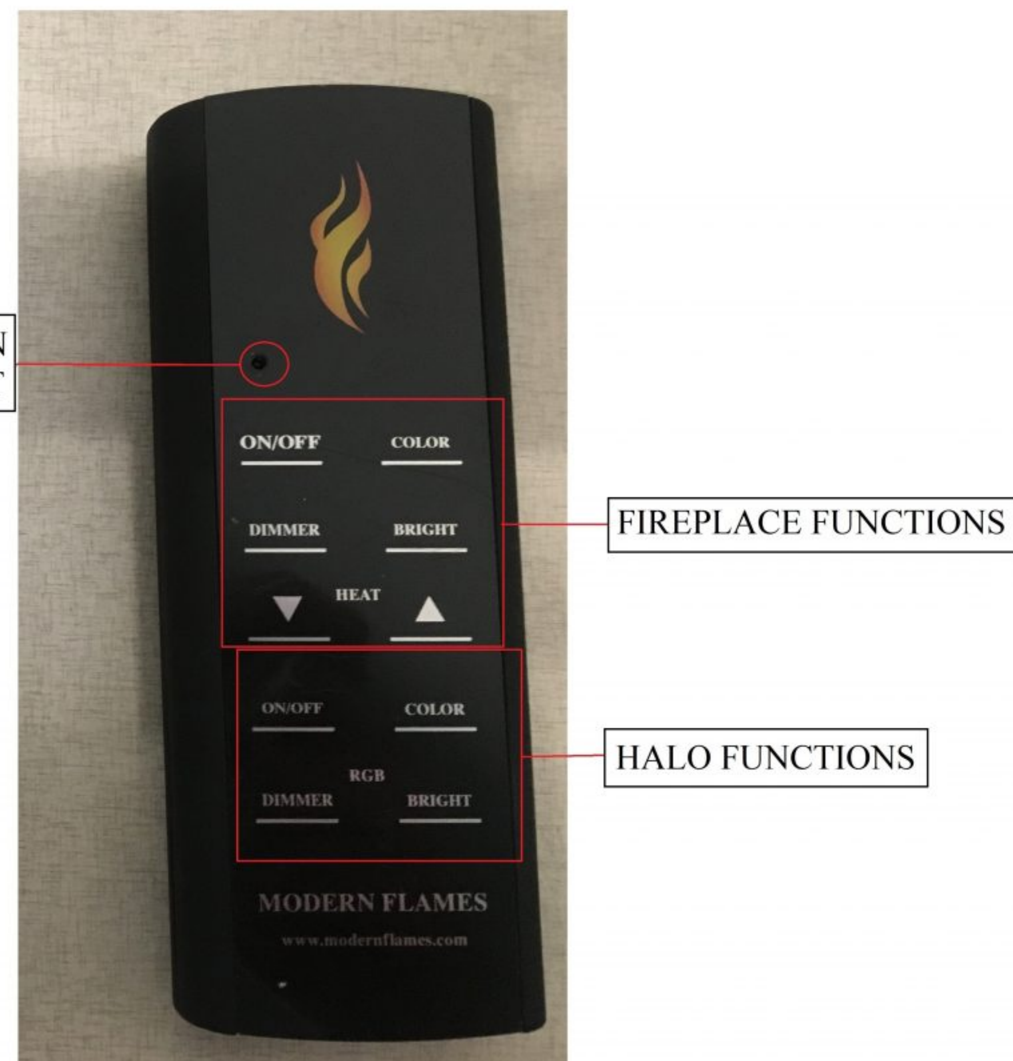
MFR2-10 CLX2 W/HALO

*NOTE* TAP OR BRIEFLY PRESS TO PERFORM A FUNCTION, STAND AT LEAST 2 FEET AWAY FROM UNIT TO ALLOW LINE OF SIGHT FOR I.R. SENSOR