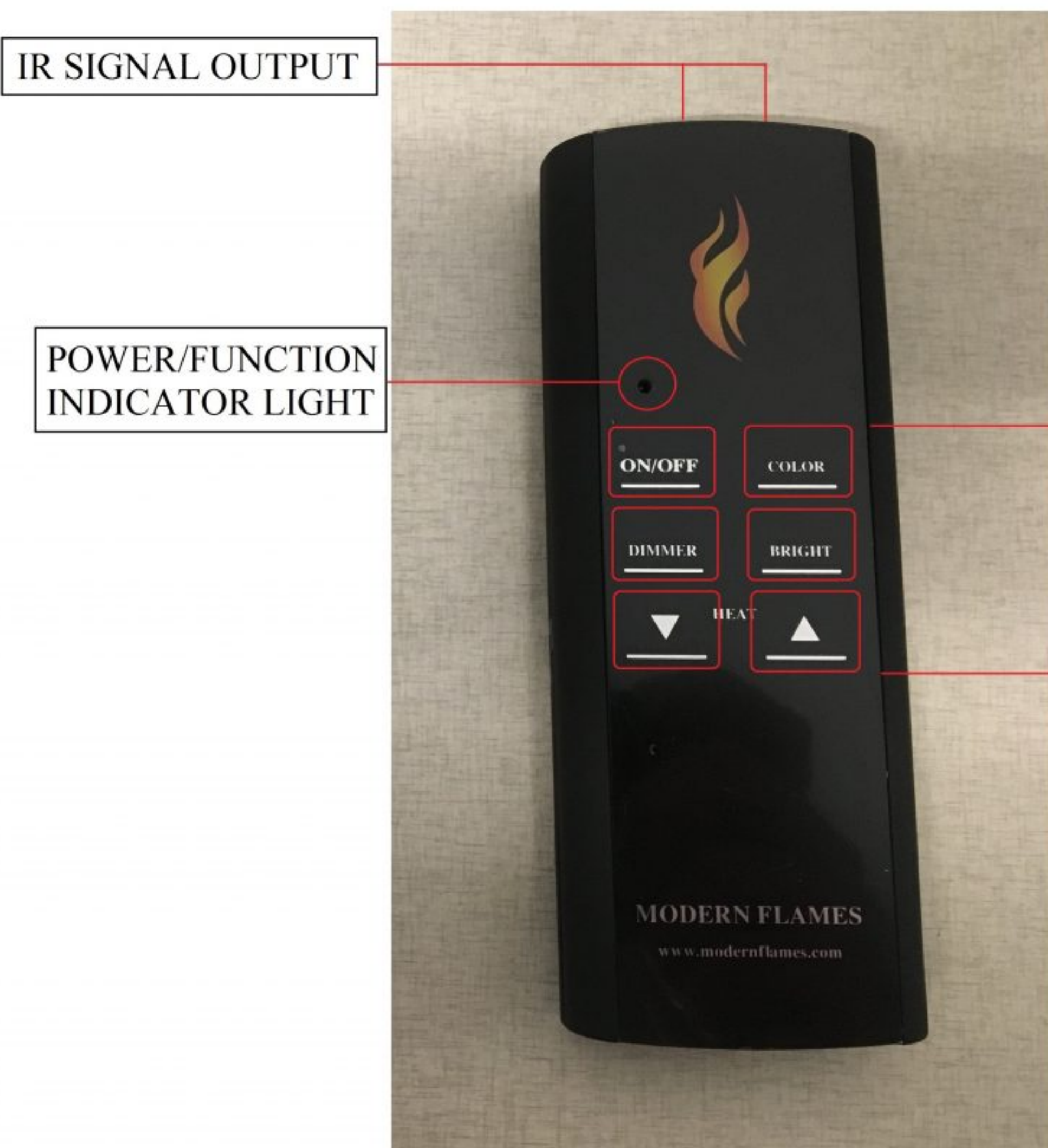
MFR2-6 CLX2, Lfv2