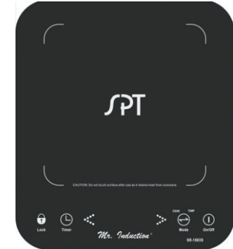
SR-1883G: Gold SR-1883S: Silver