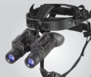
NVM14 with Dual Bridge