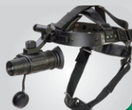
NVM14 with Goggle kit