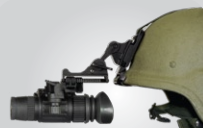
NVM14 with PAGST Helmet Mount