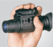
NVM14 Compact Monocular